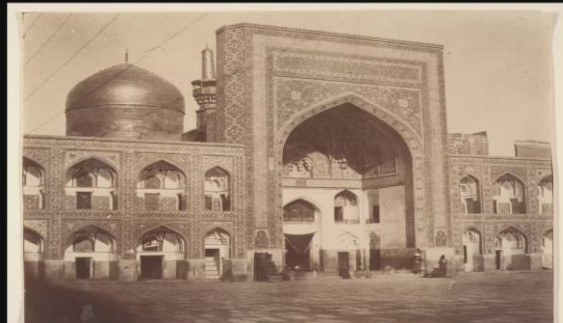
Tomb entrance, interior and exterior, Tomb of Esther and Mordechai, Hamadan, Iran